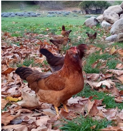
Big Bertha, our largest young hen, is also one of our gentlest.