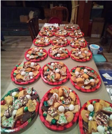
Christmas cookie plates: an annual tradition.