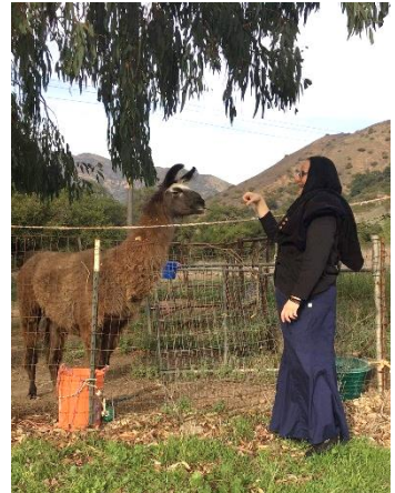
Saying hello to our friendly neighborhood llama.